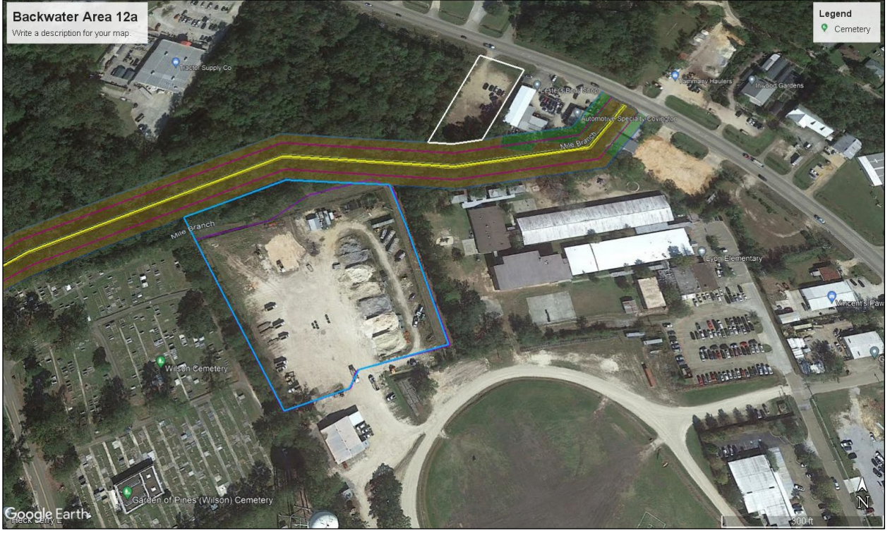
Figure 15:1-1. Location of Backwater Site to Create Stream Mud Bottom along Mile Branch Note: The light blue line is the approximate area. The purple line represents the extent of the city owned property adjacent to Mile Branch.